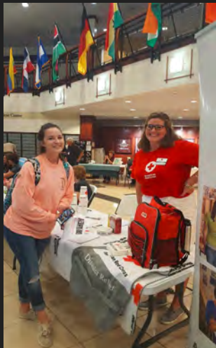
College Volunteer Fair