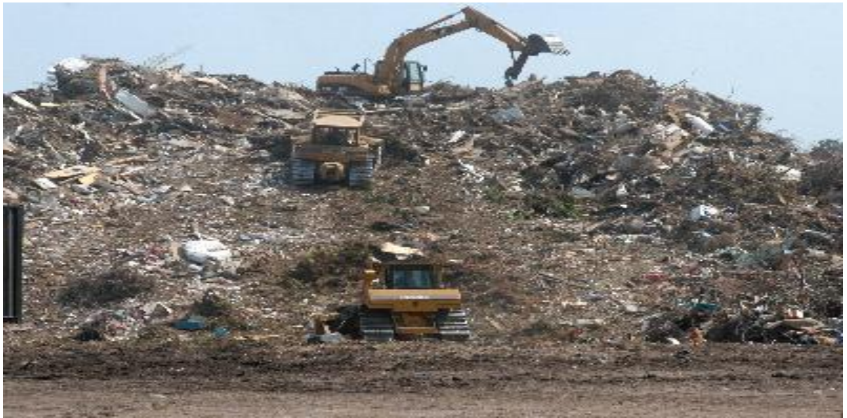
Improper Site Operation