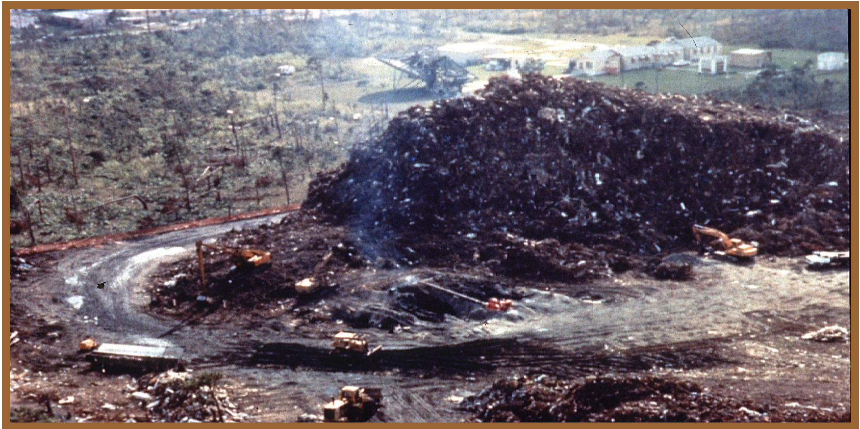
Improper Site Layout